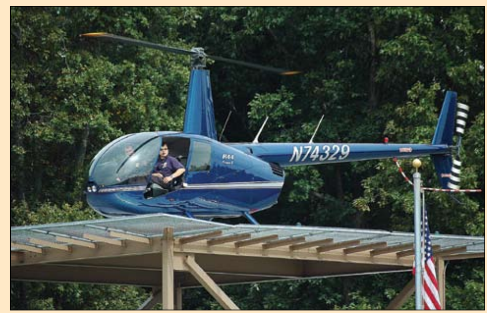
The Robinson helipad improved the safety of the Stone Mountain Memorial Park's Helicopter Operations.

fter years of making do with a ground-level, public parking lot from which to operate their helicopter, safety concerns compelled Stone Mountain Memorial Park's Department of Public Safety to install a Robinson Rooftop Helipad.