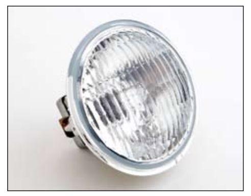
HID Lights Last Much Longer than Conventional Bulbs

Long-lasting, energy-efficient Xenon High Intensity Discharge (HID) landing lights are now available as an option on new R44 Raven II, R44 Raven I, and R22 Beta II helicopters. Current list price is $850 US.