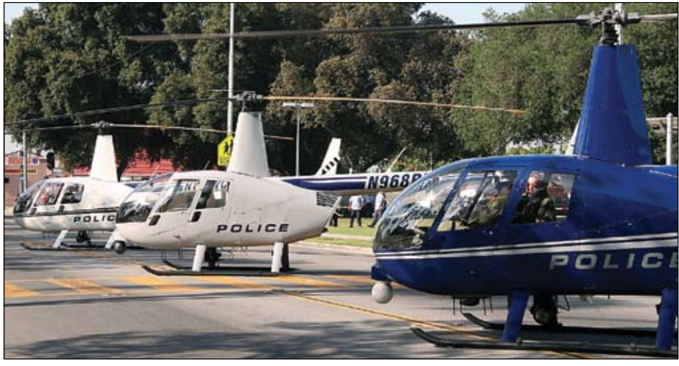
Region One Air Support's Fleet of Robinson R44 Police Helicopters with the newest, Air 77, in the middle.