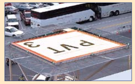
The new Robinson-built helipad from which Chief Kelley operates the helicopter.

The helipad improved safety by moving the helicopter operations away from pedestrian-accessible areas, creating safe approach and departure paths, and