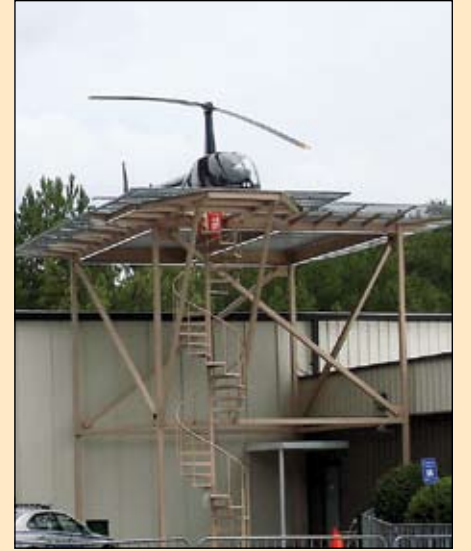
The new Robinson-built helipad is supported by a free standing, 24-foot high steel platform.

From approval to final assembly, the project took nine months to complete.