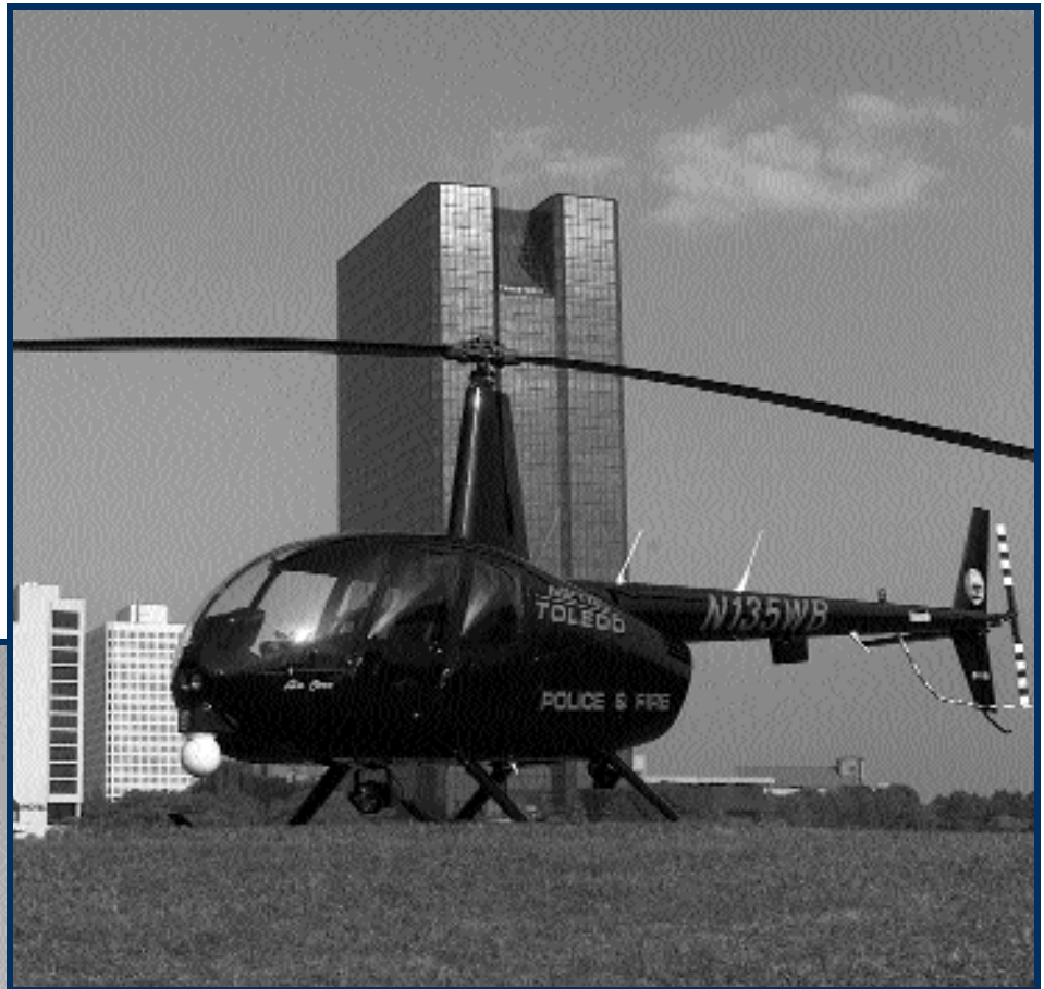
Above, Toledo's 'Air One' R44 Police Helicopter parked on the banks of Ohio's Maumee River.